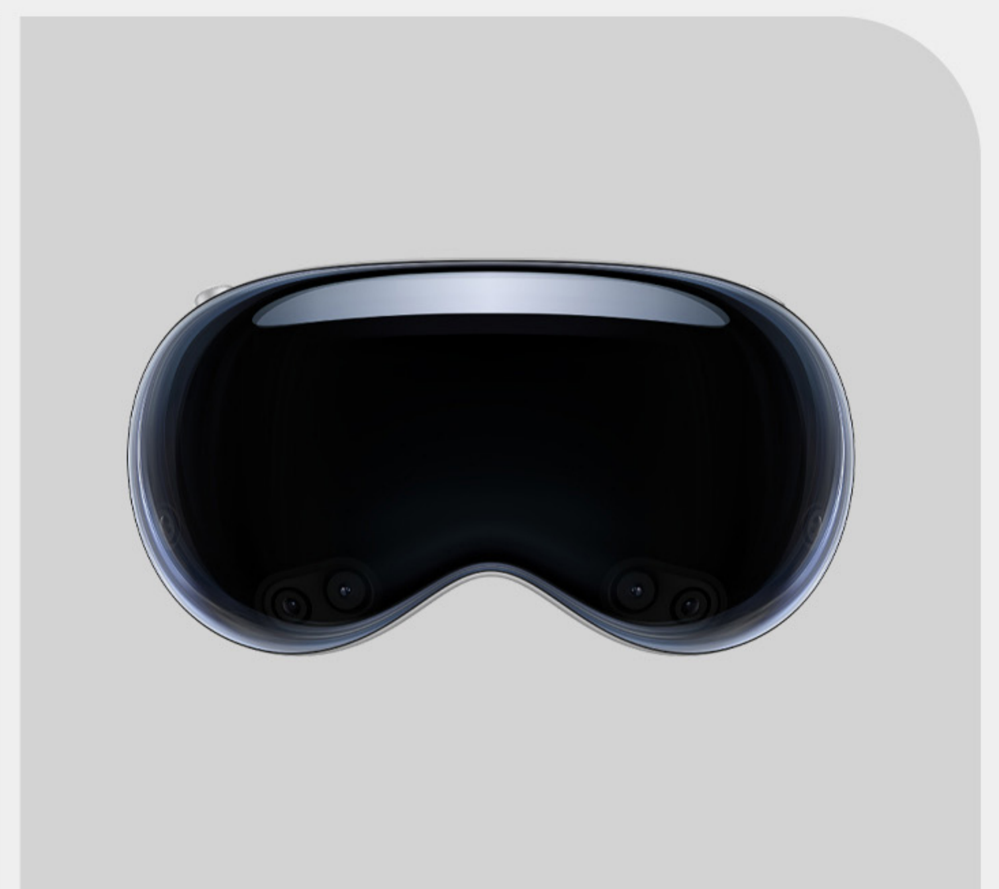
Apple Vision Pro